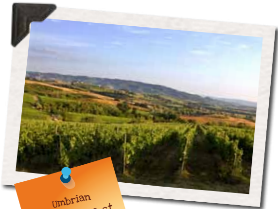
Umbrian picture-perfect landscapes

In Umbria extraordinary art and architecture gems are surrounded by picture-perfect landscapes, covered with vineyards and secular olive trees. Fresh, local and seasonal food - cheese, cereals, legumes, cured meat, saffron, mushrooms, truffles - is the delight of a tasty rural cuisine, whose recipes have passed between generations as a cultural legacy. Discover Umbrian cuisine with ALMA chefs.